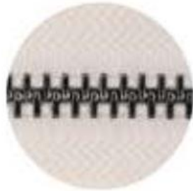
N5 / 6mm