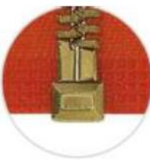
Metal pim box