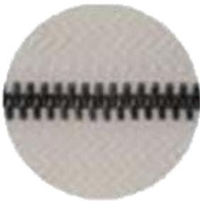
N4 / 4mm

Precisely formed teeth improve zip's appearance and enhances its durability. Carefully finished teeth make zipper moving smoothly.