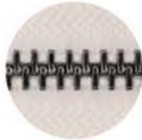
N8 / 8mm