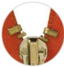
Metal top stops