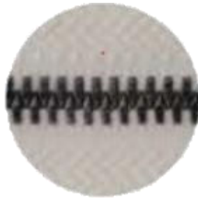
N5 / 6mm