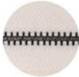
N4 / 4mm