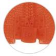
Plastic pin box