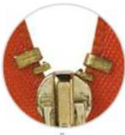
Metal top stops