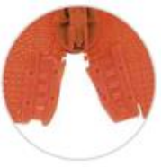
Plastic pin to pin