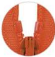
Plastic top stops