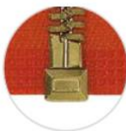
Metal pin box