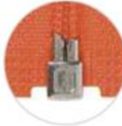
Metal pin box