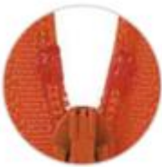
Film top stops