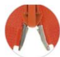
Metal pin to pin