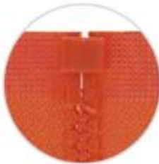
Plastic pin box