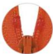
Film top stops