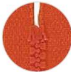
Plastic end stop