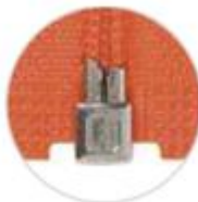
Metal pin box