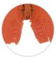
Plastic pin to pin