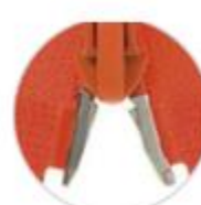
Metal pin to pin