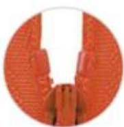
Plastic top stops