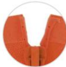
Plastic pin to pin