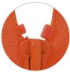
Plastic top stops