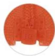
Plastic pin box